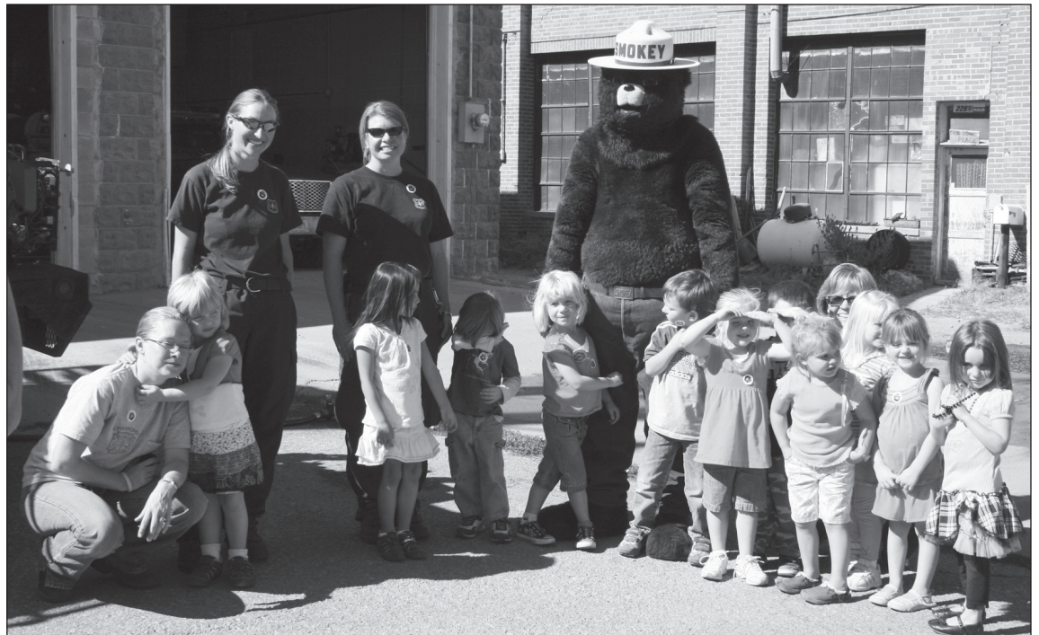
Smokey Bear and members of the Crawford Volunteer Fire Department and Forest Service posed with Crawford Preschool students during the Fire Department's Open House Tuesday, October 5 in conjunction with Fire Prevention Week October 3-9.